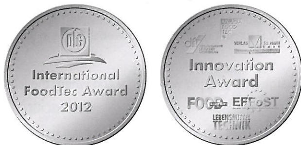
International FoodTec Award

HyCLEAN CIP, our highly efficient cleaning system for plastic modular belts, has also been honored with a Silver Medal International FoodTec Award. This was presented on March 27, 2012, at the Anuga Foodtec exhibition in Cologne, Germany. The award is made every three years by the DLG-Verlag (German Agricultural Society publisher) and its media partners, which include EFFoST (the European Federation of Food Science and Technology). The International FoodTec Awards recognize exemplary innovation in the European food industry and its equipment and component suppliers.